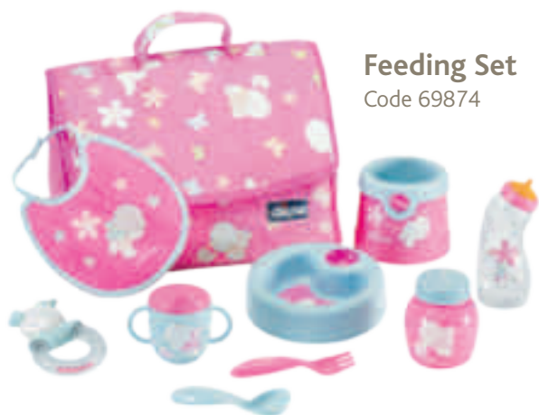
Feeding Set Code 69874