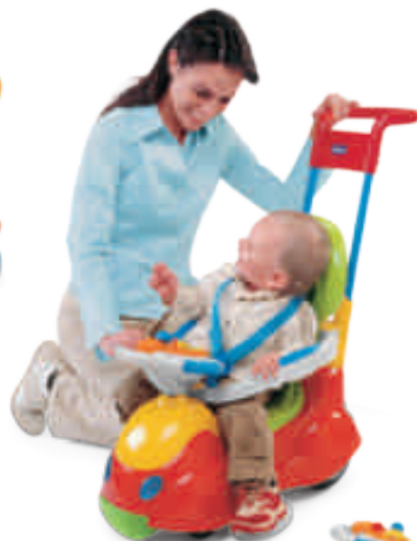
2. Push 'n' Go