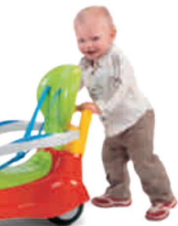
3. Push 'n' Walk

1) A Rocker, ideal for small children. 2) A Push 'n' Go with practical parent handle. 3) A Push 'n' Walk with a handy support for baby's first steps. 4) A Sit 'n' Ride so that baby can move in complete freedom. Featuring a detachable activity centre that has a horn, steering wheel and an accelerator lever with sound effects.