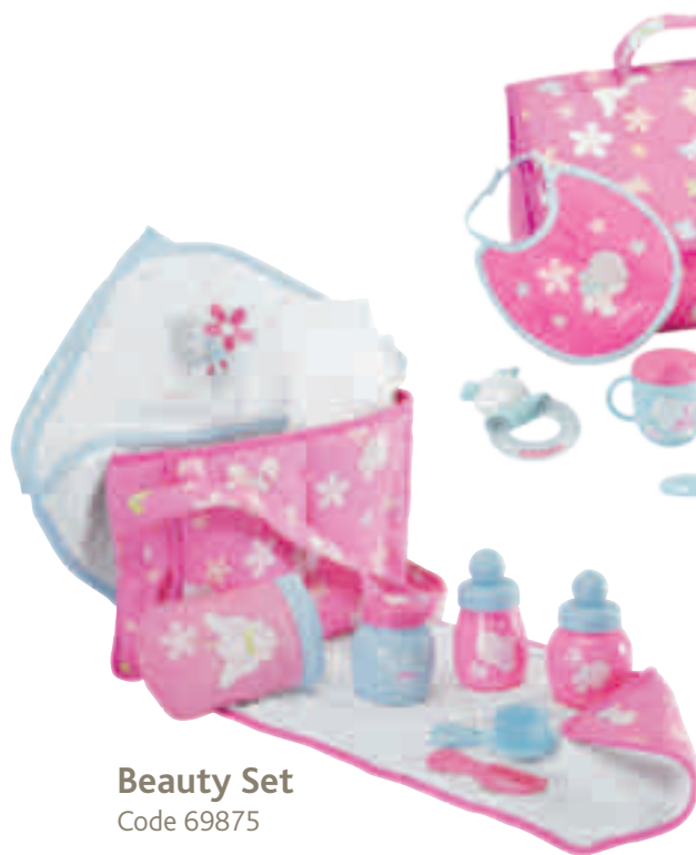
Beauty Set Code 69875

A complete line of accessories to play at being mum: from feeding to bathtime, from naptime to going for a walk. All the necessary items to take care of Baby Chicca and Chicco. The products have been created so they are just like the real thing.