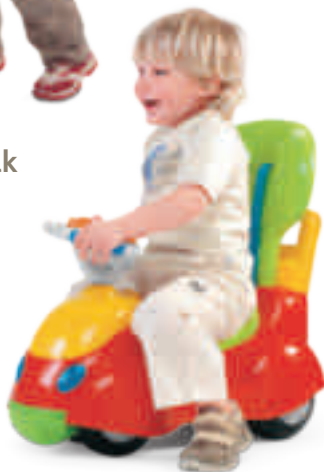
4. Sit 'n' Ride