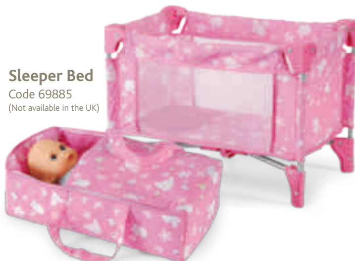
Sleeper Bed Code 69885 (Not available in the UK)