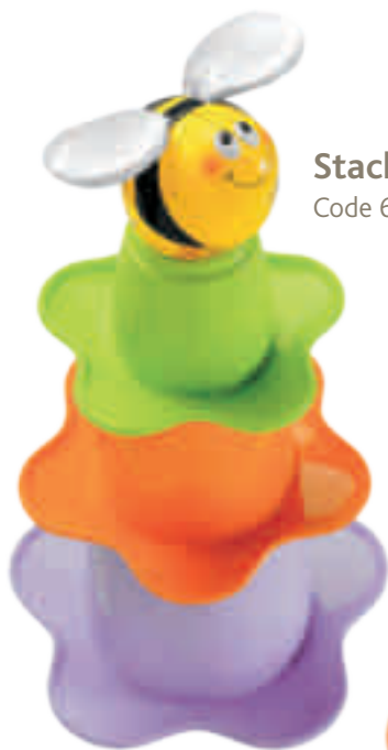
Stacking Tulips Code 66719