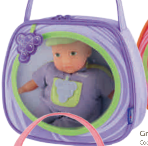
Grape Code 70644