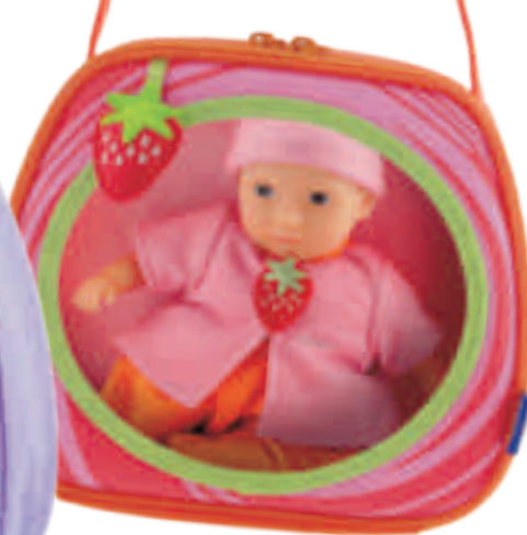
Strawberry Code 70643