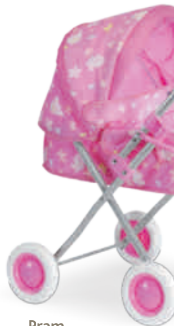
Pram Code 69883