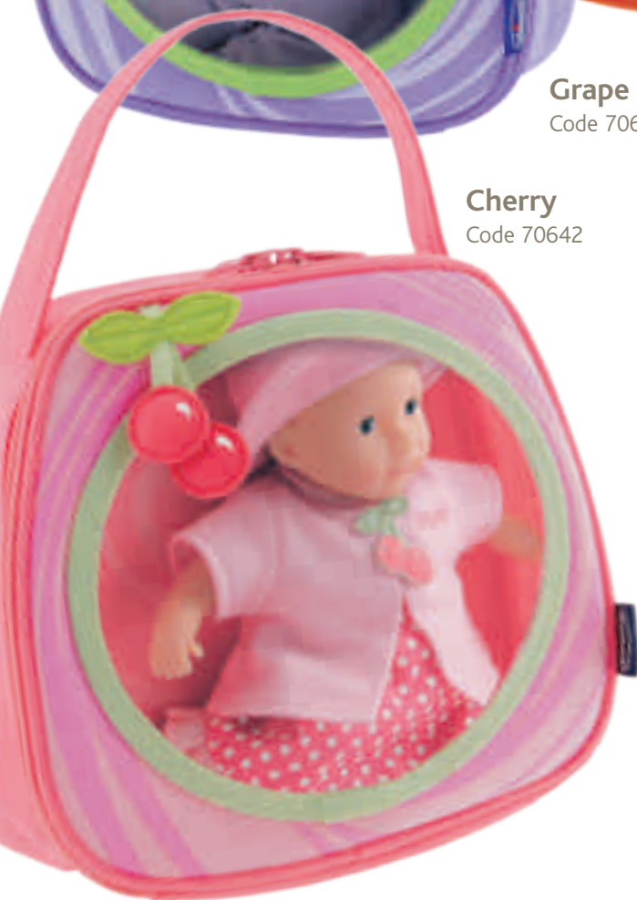
Cherry Code 70642