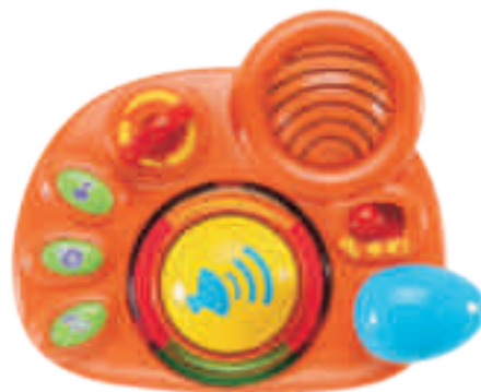
Removable Electronic Activity Centre