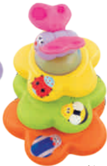
Stacking Flowers Code 66718

Toys that can be stacked, sorted or pulled along, encouraging children to develop their logical association and movement co-ordination skills.